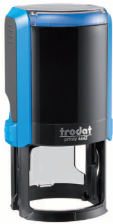
Round stamp imprint - not actual size.

For More Notary Products & Options Visit Our Website at www.NotaryPublicUnderwriters.com